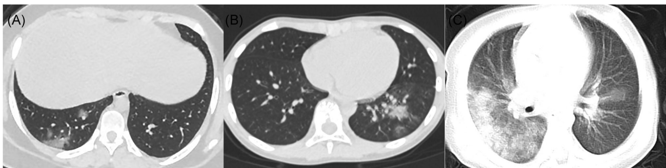
FIGURE 1 A, Female, 14 years old. Chest CT showed scattered ground-glass opacities in the inferior lobe of the right lung, located subpleural or extended from subpleural lesions. B, Male, 10 years old. Chest CT showed consolidation with halo sign in the inferior lobe of the left lung surrounded by ground-glass opacities. C, Male, 1 year old. Chest CT showed diffused consolidations and ground-glass opacities in both lungs, with a "white lung" appearance of the right lung. CT, computed tomography

Early stage: 6 patients presented with unilateral pulmonary lesions (6/20, 30%), 10 presented with bilateral pulmonary lesions (10/20, 50%), and 3 neonates and 1 child showed no abnormality on chest CT (4/20, 20%). Subpleural lesions with localized inflammatory infiltration were found in all children (Figure 1A). Consolidation with surrounding halo sign was observed in 10 patients (10/20, 50%), ground-glass opacities were observed in 12 patients (12/20, 60%), fine mesh shadow was observed in 4 patients (4/20, 20%), and tiny